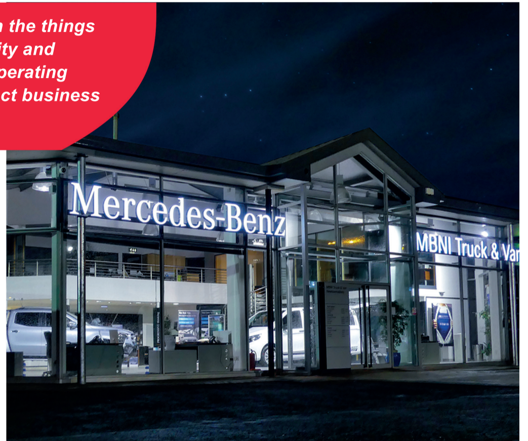
MBNI Truck & Van, 47 Mallusk Road, BT36 4PJ, Co. Antrim

For more info, or to book a test drive, contact any of the Van sales team at Mallusk on 028 9009 8632.